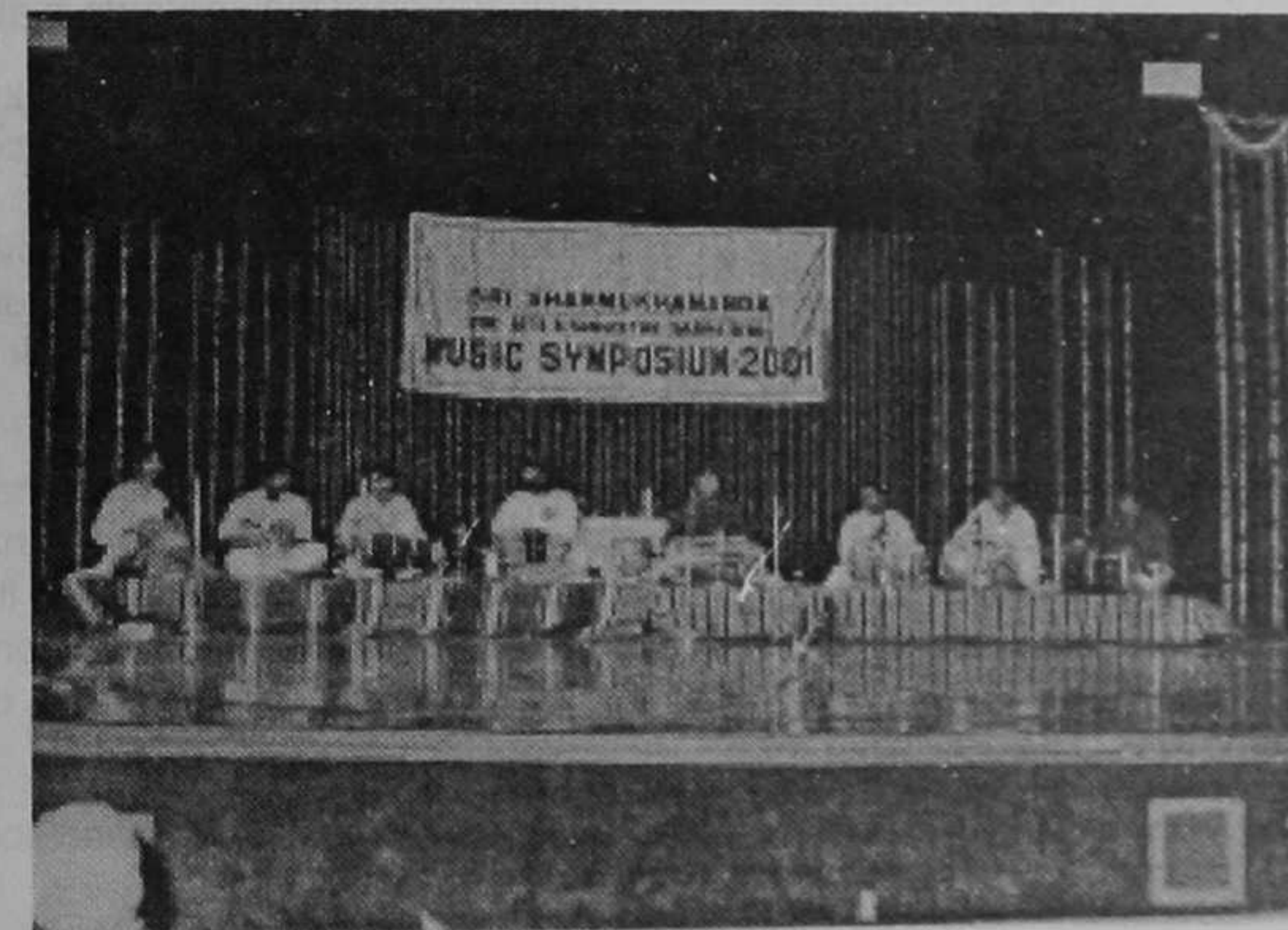
The Percussion Ensemble

undergo the rigours of an ascetic life and dedication to one's Preceptors and Principles was the prime consideration in gaining the Guru's confidence and blessings. Even kings of yore used to send their princelings to the "Ashram" of a "Rishi" or a sage, for a lengthy period - away from the trappings of palatial grandeur and the perquisites attached to it. Every student was treated on par, irrespective of his social standing outside the Ashram. The Guru and his spouse